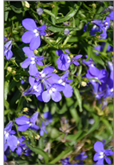
Suntory Compact Blue Lobelia flowers