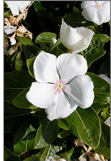
Vitesse White Vinca flowers

Vitesse White Vinca is recommended for the following landscape applications;