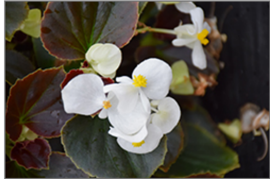
Eureka Bronze Leaf White Begonia flowers