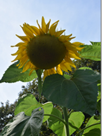
Giganteus Sunflower flowers

11301 S. Virginia Street Reno, NV 89511 (775) 853-1319