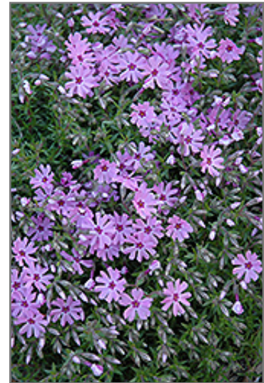
Fort Hill Moss Phlox flowers

Fort Hill Moss Phlox is recommended for the following landscape applications;