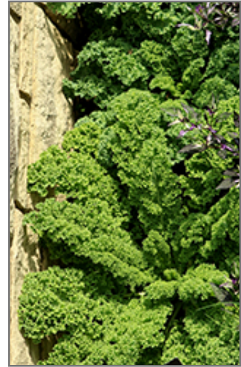
Dwarf Blue Curled Vates Kale foliage

This plant is typically grown in a designated vegetable garden. It does best in full sun to partial shade. It does best in average to evenly moist conditions, but will not tolerate standing water. It may require supplemental watering during periods of drought or extended heat. It is not particular as to soil pH, but grows best in rich soils. It is somewhat tolerant of urban pollution. Consider applying a thick mulch around the root zone over the growing season to conserve soil moisture. This is a selected variety of a species not originally from North America.