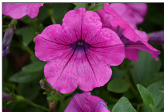
Opera Supreme Purple Petunia flowers

Opera Supreme Purple Petunia is recommended for the following landscape applications;