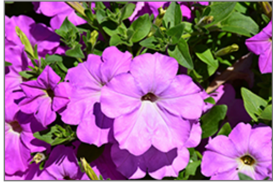
Opera Supreme Lavender Petunia flowers

Opera Supreme Lavender Petunia is recommended for the following landscape applications;