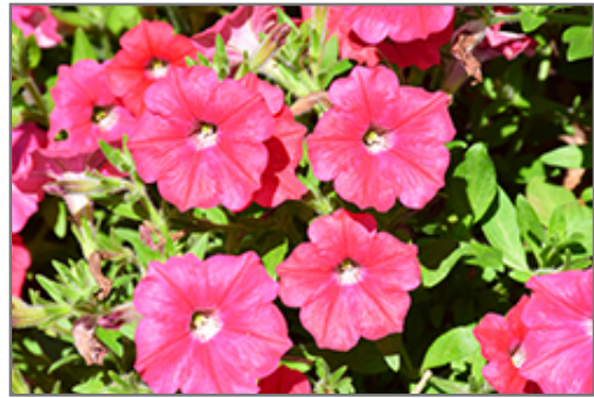
Opera Supreme Coral Petunia flowers

Opera Supreme Coral Petunia is recommended for the following landscape applications;