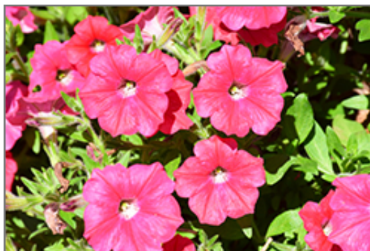
Opera Supreme Coral Petunia flowers

Opera Supreme Coral Petunia is recommended for the following landscape applications;