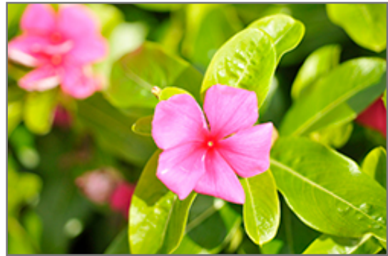
Pacifica XP Punch Vinca flowers

This plant will require occasional maintenance and upkeep, and should not require much pruning, except when necessary, such as to remove dieback. It is a good choice for attracting butterflies to your yard, but is not particularly attractive to deer who tend to leave it alone in favor of tastier treats. It has no significant negative characteristics.