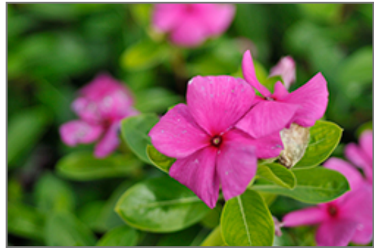
Pacifica XP Lilac Vinca flowers

This plant will require occasional maintenance and upkeep, and should not require much pruning, except when necessary, such as to remove dieback. It is a good choice for attracting butterflies to your yard, but is not particularly attractive to deer who tend to leave it alone in favor of tastier treats. It has no significant negative characteristics.