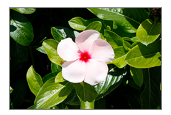
Pacifica XP Apricot Vinca flowers