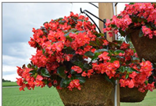
Viking Explorer Red on Green Begonia in bloom