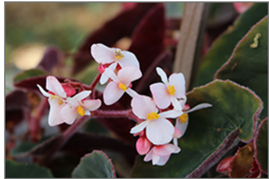
Ramirez Begonia flowers