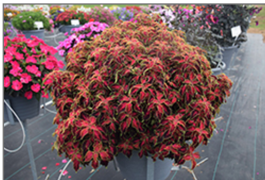
PartyTime Ruby Punch Coleus