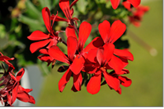
Caldera Red Geranium flowers

Moana Lane Garden Center & Corporate Office South Virginia St. Garden Center 1100 W. Moana Lane Reno, NV 89509 (775) 825-0600 (775) 825-0602 - Corporate Office