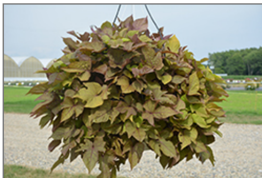
Floramia Verdino Sweet Potato Vine

Floramia Verdino Sweet Potato Vine will grow to be about 8 inches tall at maturity, with a spread of 24 inches. When grown in masses or used as a bedding plant, individual plants should be spaced approximately 20 inches apart. Its foliage tends to remain low and dense right to the ground. This fast-growing annual will normally live for one full growing season, needing replacement the following year.