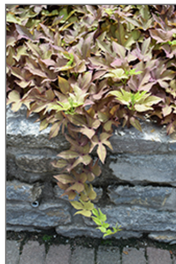
Floramia Verdino Sweet Potato Vine