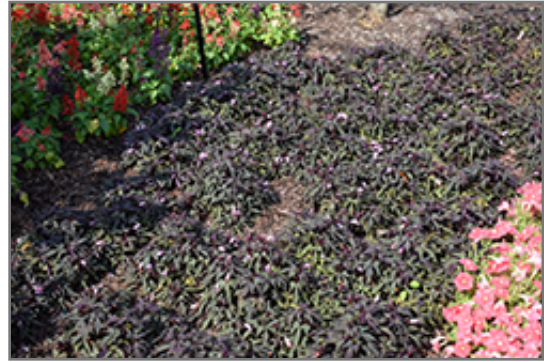
Floramia Cameo Sweet Potato Vine in bloom

Floramia Cameo Sweet Potato Vine will grow to be about 8 inches tall at maturity, with a spread of 24 inches. When grown in masses or used as a bedding plant, individual plants should be spaced approximately 20 inches apart. Its foliage tends to remain low and dense right to the ground. This fast-growing annual will normally live for one full growing season, needing replacement the following year.