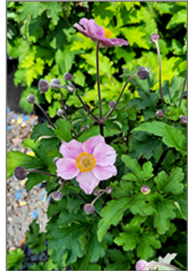
Pink Saucer Anemone flowers

Pink Saucer Anemone is recommended for the following landscape applications;