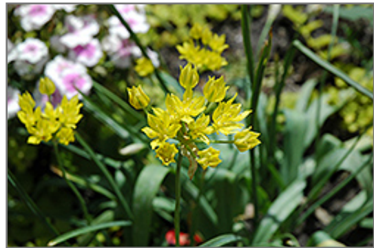
Golden Garlic flowers