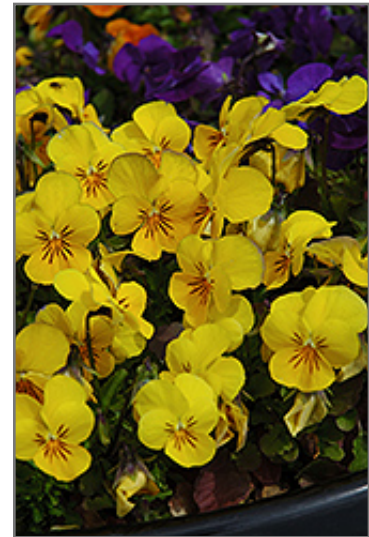
Penny Yellow Pansy flowers