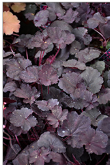
Black Forest Cake Coral Bells foliage