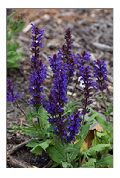
Woodland Sage flowers

An attractive plant that is easy to propagate and grow, with many cultivars and hybrids available; pretty spikes of long lasting royal blue flowers from burgundy buds; somewhat drought tolerant; excellent for the sunny border or containers