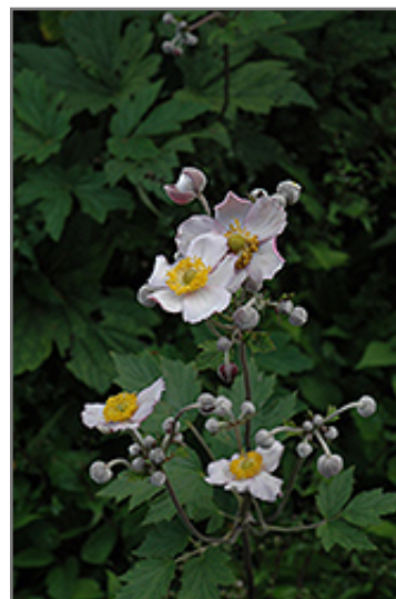
Grapeleaf Anemone flowers

Grapeleaf Anemone is recommended for the following landscape applications;