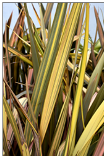
Misty Cream New Zealand Flax foliage