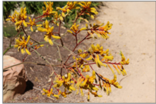
Yellow Gem Kangaroo Paw flowers

Yellow Gem Kangaroo Paw is recommended for the following landscape applications;