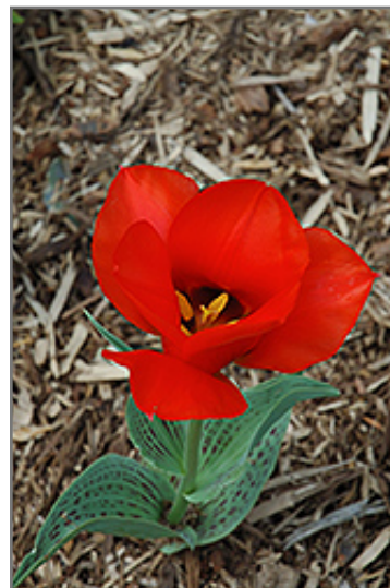
Casa Grande Tulip flowers