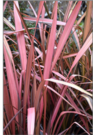
Maori Sunrise New Zealand Flax foliage