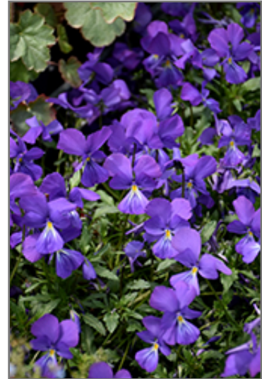
Corsican Pansy flowers

Corsican Pansy is recommended for the following landscape applications;