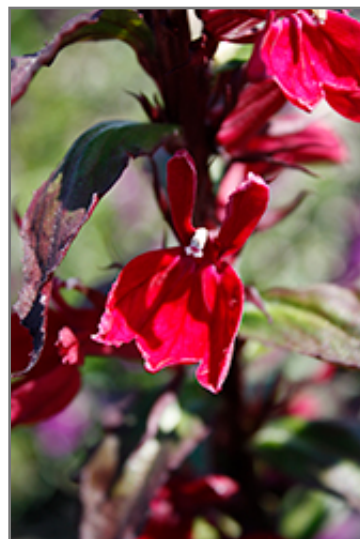
Starship Burgundy Lobelia flowers

Starship Burgundy Lobelia is recommended for the following landscape applications;