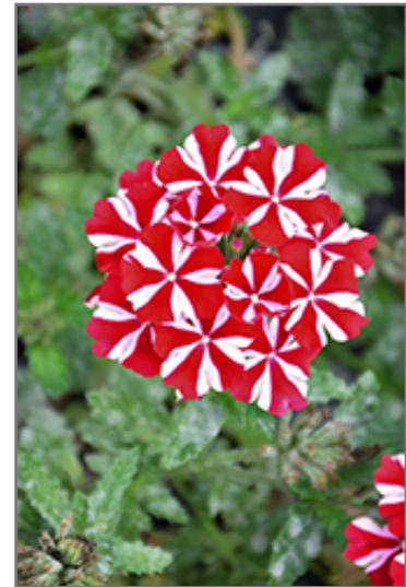
Samira Deep Red Star Verbena flowers

Samira Deep Red Star Verbena is recommended for the following landscape applications;