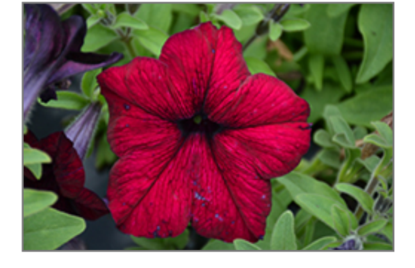
Success! 360 Burgundy Petunia flowers