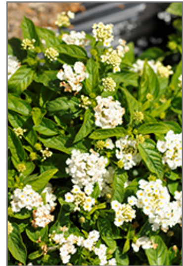
Gem Compact White Sapphire Lantana flowers

Gem Compact White Sapphire Lantana is recommended for the following landscape applications;