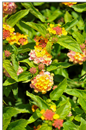
Gem Compact Rose Quartz Lantana flowers

Gem Compact Rose Quartz Lantana is recommended for the following landscape applications;