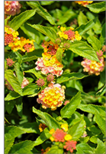
Gem Compact Rose Quartz Lantana flowers

Gem Compact Rose Quartz Lantana is recommended for the following landscape applications;