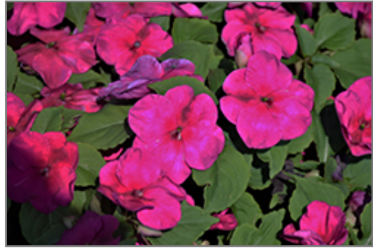
Xtreme Violet Impatiens flowers

Xtreme Violet Impatiens is recommended for the following landscape applications;