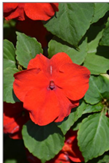
Xtreme Red Impatiens flowers

Xtreme Red Impatiens is recommended for the following landscape applications;