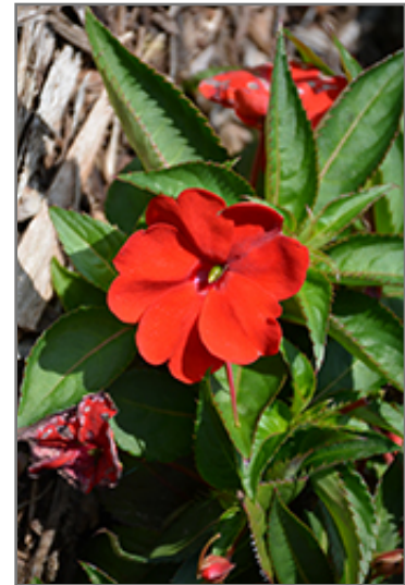
SunStanding Fire Red Impatiens flowers

SunStanding Fire Red Impatiens is recommended for the following landscape applications;