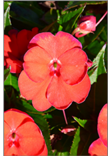
SunStanding Orange Aurora Impatiens flowers

SunStanding Orange Aurora Impatiens is recommended for the following landscape applications;