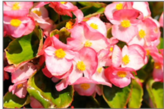
Super Cool Blush Begonia flowers

Super Cool Blush Begonia is recommended for the following landscape applications;