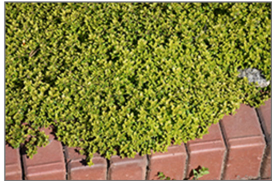
Archer's Gold Thyme

Archer's Gold Thyme's attractive tiny fragrant round leaves remain chartreuse in color with hints of yellow throughout the year on a plant with a spreading habit of growth.