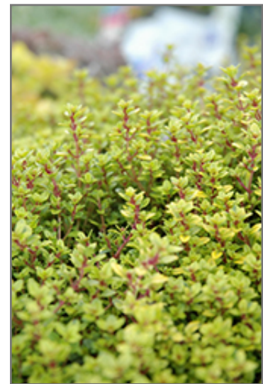
Archer's Gold Thyme flowers