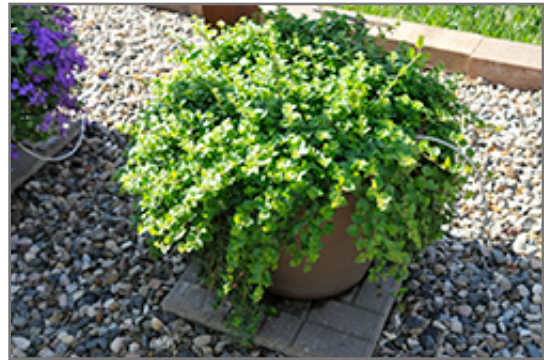
Indian Mint