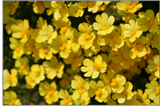
Nessie Plus Yellow Nemesis flowers

Nessie Plus Yellow Nemesis is recommended for the following landscape applications;