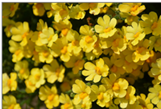
Nessie Plus Yellow Nemesia flowers

Nessie Plus Yellow Nemesia is recommended for the following landscape applications;