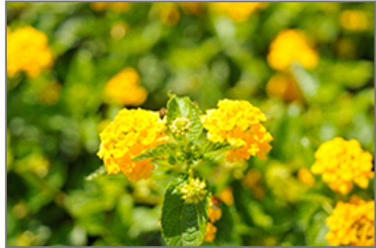
Landmark Gold Lantana flowers

Landmark Gold Lantana is recommended for the following landscape applications;