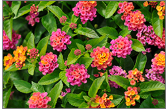
Bloomify Rose Lantana flowers

Bloomify Rose Lantana is recommended for the following landscape applications;