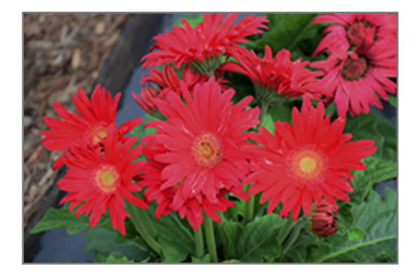
Flori Line Maxi Dark Purple Gerbera Daisy flowers