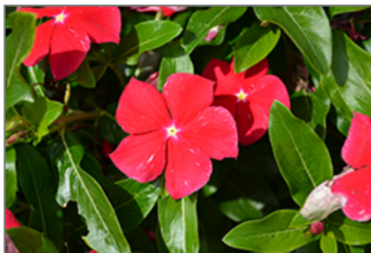
Cora XDR Red Vinca flowers

Cora XDR Red Vinca is recommended for the following landscape applications;