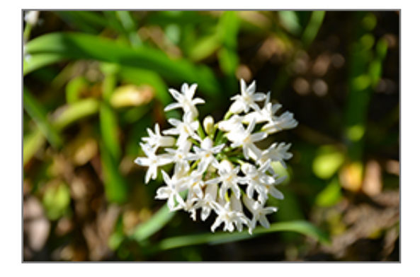
White Sweet Garlic flowers

Landscape Services & Design Center 1190 W. Moana Lane Reno, NV 89509 (775) 825-0602 ext. 134 NV Lic. #3379A, D & CA Lic. #317448