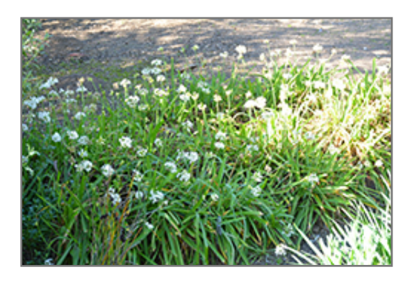
White Sweet Garlic in bloom