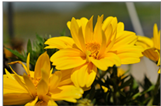
Sun Drop Double Yellow Bidens flowers