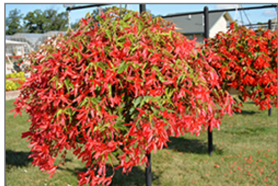
Bossa Nova Rose Begonia flowers