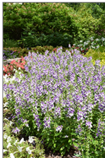
Alonia Big Bicolor Purple Angelonia in bloom

Alonia Big Bicolor Purple Angelonia is a fine choice for the garden, but it is also a good selection for planting in outdoor containers and hanging baskets. With its upright habit of growth, it is best suited for use as a 'thriller' in the 'spiller-thriller-filler' container combination; plant it near the center of the pot, surrounded by smaller plants and those that spill over the edges. Note that when growing plants in outdoor containers and baskets, they may require more frequent waterings than they would in the yard or garden.